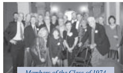
Members of the Class of 1974

the GSPP Class of 1974 rekindled friendships and organized a weekend full of exciting events.