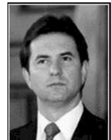
Minister Esteban Moctezuma

Esteban Moctezuma Barragán , Mexico’s Secretary of Social Development, “Mexico’s Social Challenges for the 21st Century”