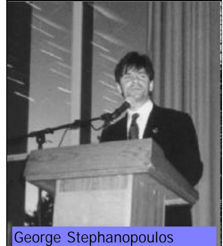
George Stephanopoulos spoke to a crowd of 800.

In the spring, former top Clinton aide George Stephanopoulos spoke from personal experience about his experiences in the White House, including his pride and shame in the President and his actions. In a speech sponsored by GSPP and the Commonwealth Club of California, Stephanopoulos